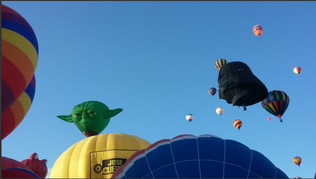
Darth Vader and Yoda are two favorites at the Balloon Fiesta

balloons are inflated. There is usually 2 count downs so all balloons lite up at the same time. Then there is a yellow balloon which is known as the spirit of the fiesta 2 and which they sing the national anthem as it goes up into the sky and takes flight. After that, all of the other balloons begin to inflate and take off. Many colorful balloons in special shapes and regular balloons take off to the skies. It is very fun to collect balloon cards. If you don't have any of them I recommend you to start collecting them! The balloon fiesta is from what I hear the most the most photographed event in the world. There is lots of good pictures to take but it's just the matter that the event is to short and does not take a long time for you to enjoy it.