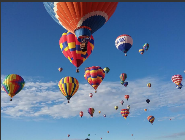
Hundreds of balloons fill the sky of Albuquerque.